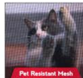
Pet Resistant Mesh