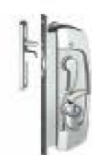
Anti-lift pin on built-up strike prevents door being lifted out