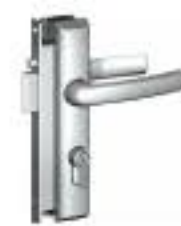
Jemmy Resistant Tongue with deformable strike plate