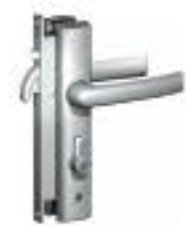
Jemmy Resistant Parrot Beak Lock Tongue, Caretaker function